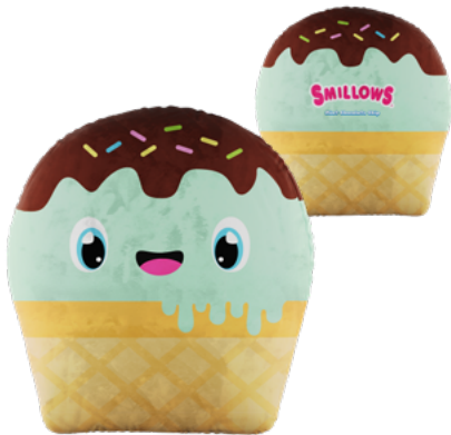
Mint Chocolate Chip