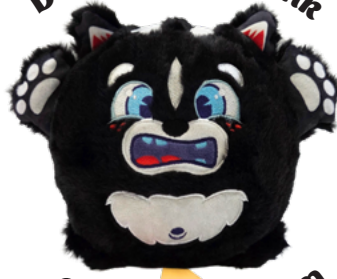
Cookies & Cream